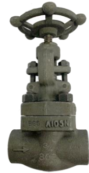
Socket Weld A105 Globe Valves